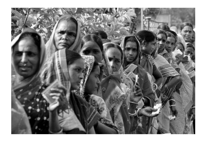
Fig. 8.1 Women in Queue Waiting to Cast their Votes During an Election

(b) Participation of women: A remarkable feature of the Indian elections is the participation of women in them. There are still nations in Asia, Africa and Latin America where women are not allowed to participate in the elections (both as a voter and as a candidate). The zeal for voting among Indian women has been as strong as among Indian men (Figure 8.1). Today women actively participate not only in the voting process, but also in securing representation in the country's Parliament and legislatures. The number of women contestants has been steadily rising since Independence, even though their proportion is small compared to men. Most political parties are still not willing to give adequate number of 'tickets' to women, even though they show their support to the principle of reserving 33 per cent representation.